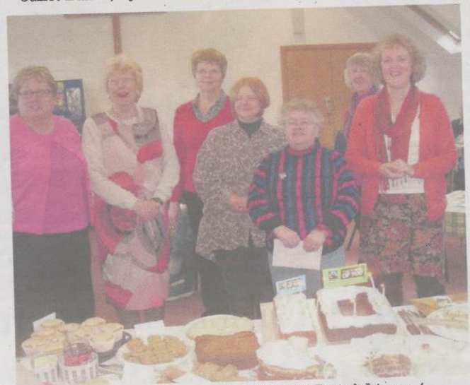
Attendees of Chepstow's Fairtrade Fortnight event